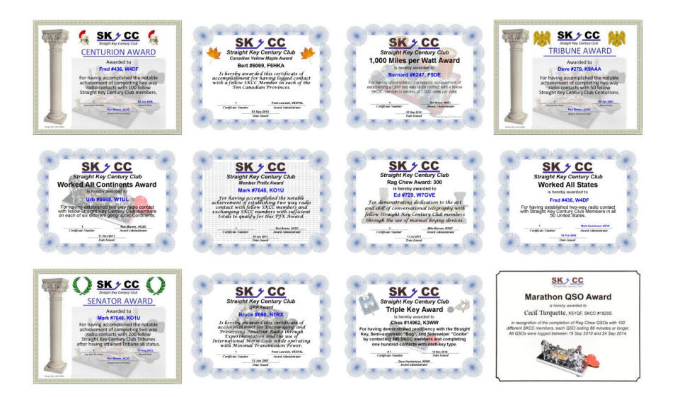
The <u>SKCCLogger</u> is highly recommended for award hunters. It keeps track of your progress and simplifies the application process.

<u>Centurion</u> or "C". The first of three basic operating endorsements. Work 100 other SKCC members. Endorsements of Cx2, Cx3, etc can be attained by working additional multiples of 100 members.