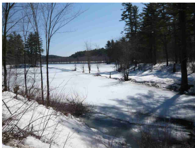
The river is opening and so is 20 meters

From my spot I look out over the cove. The water is about 8 feet higher than it is during the summer. This has caused the ice in the cove to break up. In the main part of the river, there is free flowing water.