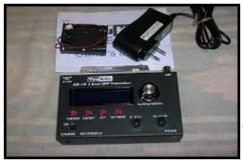
HB1B QRP Radio

As expected, everyone had good ideas and recommended various radios. One question I had for myself was, did I want to build a kit or buy something ready-made. I also went onto the Internet and started searching on YouTube. Once again I found as many different opinions as there are QRP radios. I did take a good long look at the You-kit, HB1B QRP radio, which I finally decided to buy.