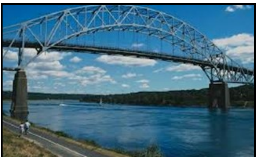
Cape Cod Canal and Bourne Bridge leading onto the Cape.

The Village of Onset, Ma is really not on Cape Cod, but is located just off of Route 6 and is known as the Gateway to Cape Cod. If you look at a map of SE Massachusetts you will see the water way known as the Cape Cod Canal. The first bridge over the Canal is the Bourne