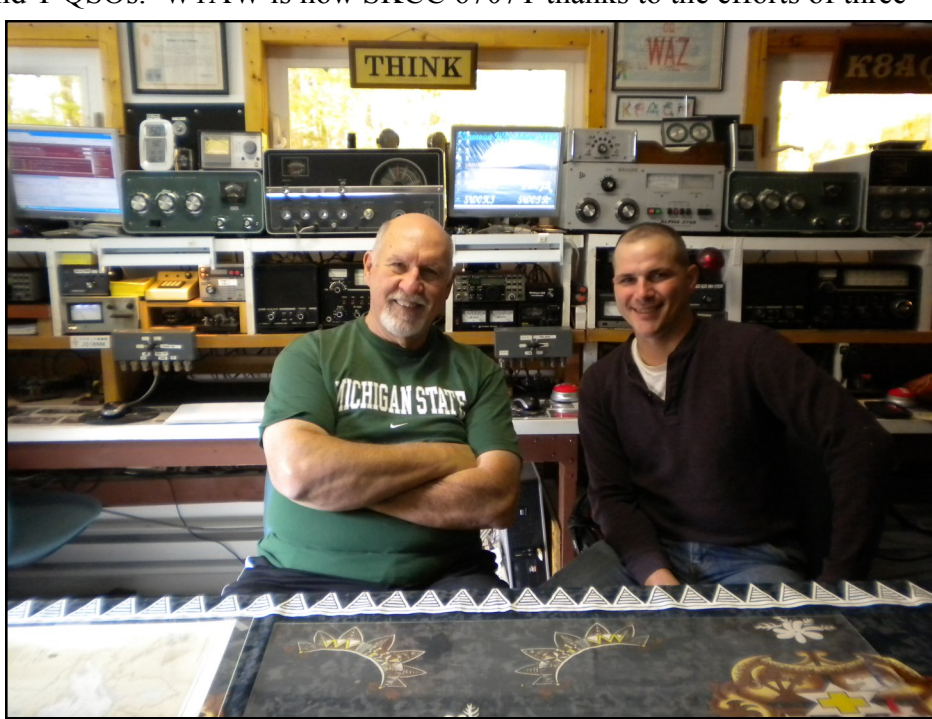
Left to right, K8AQM and KD8SKO

Each state and US possession were active for two one week periods throughout the year with activity in cw, ssb and digital modes and on all amateur bands. It was not a contest but rather like our K3Y, a birthday celebration operating event.