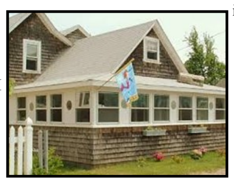
Home we rented for two weeks in Onset, MA

Our location the Village of Onset, Ma was ideal, 100 feet from the salt water of Buzzards Bay, I couldn't have asked for a better location. I tried several times to make a 5 watt contact on 20 in the middle of the afternoon with little to no