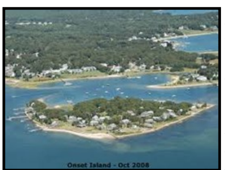
View of Onset, MA

Our location the Village of Onset, Ma was ideal, 100 feet from the salt water of Buzzards Bay, I couldn't have asked for a better location. I tried several times to make a 5 watt contact on 20 in the middle of the afternoon with little to no